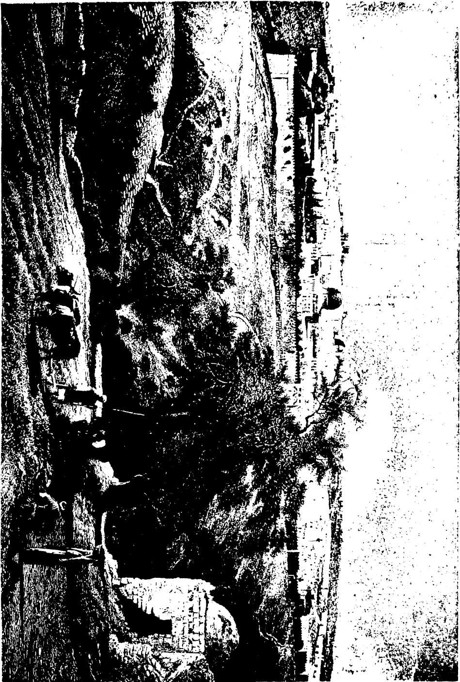
JERUSALEM FROM THE MOUNT OF OLIVES