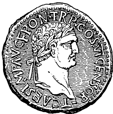
COIN OF TITUS