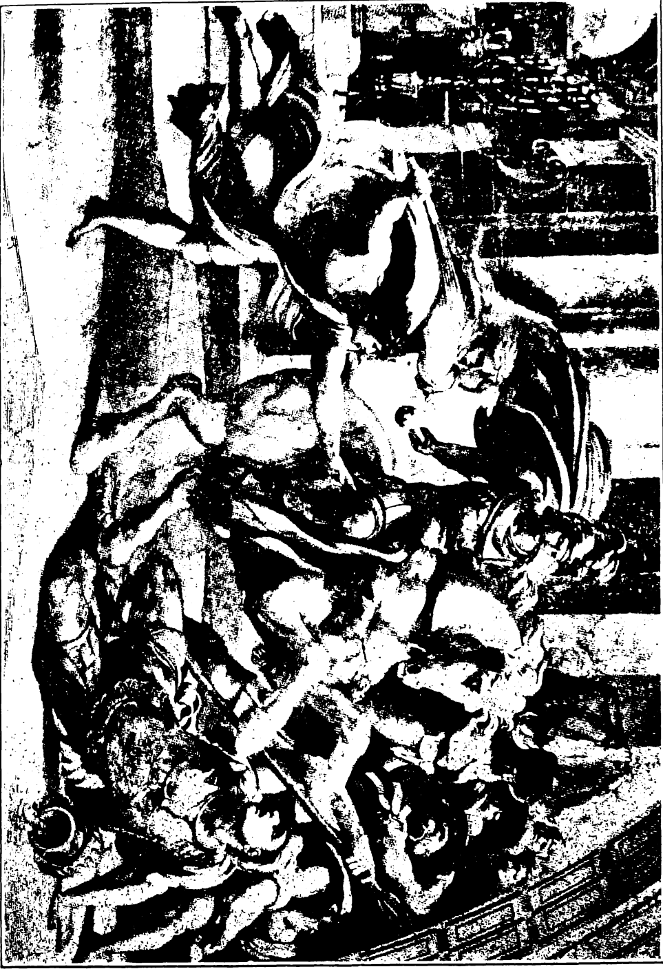
HELIODORUS DRIVEN FROM THE TEMPLE