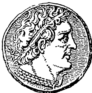
COIN OF PTOLEMY I