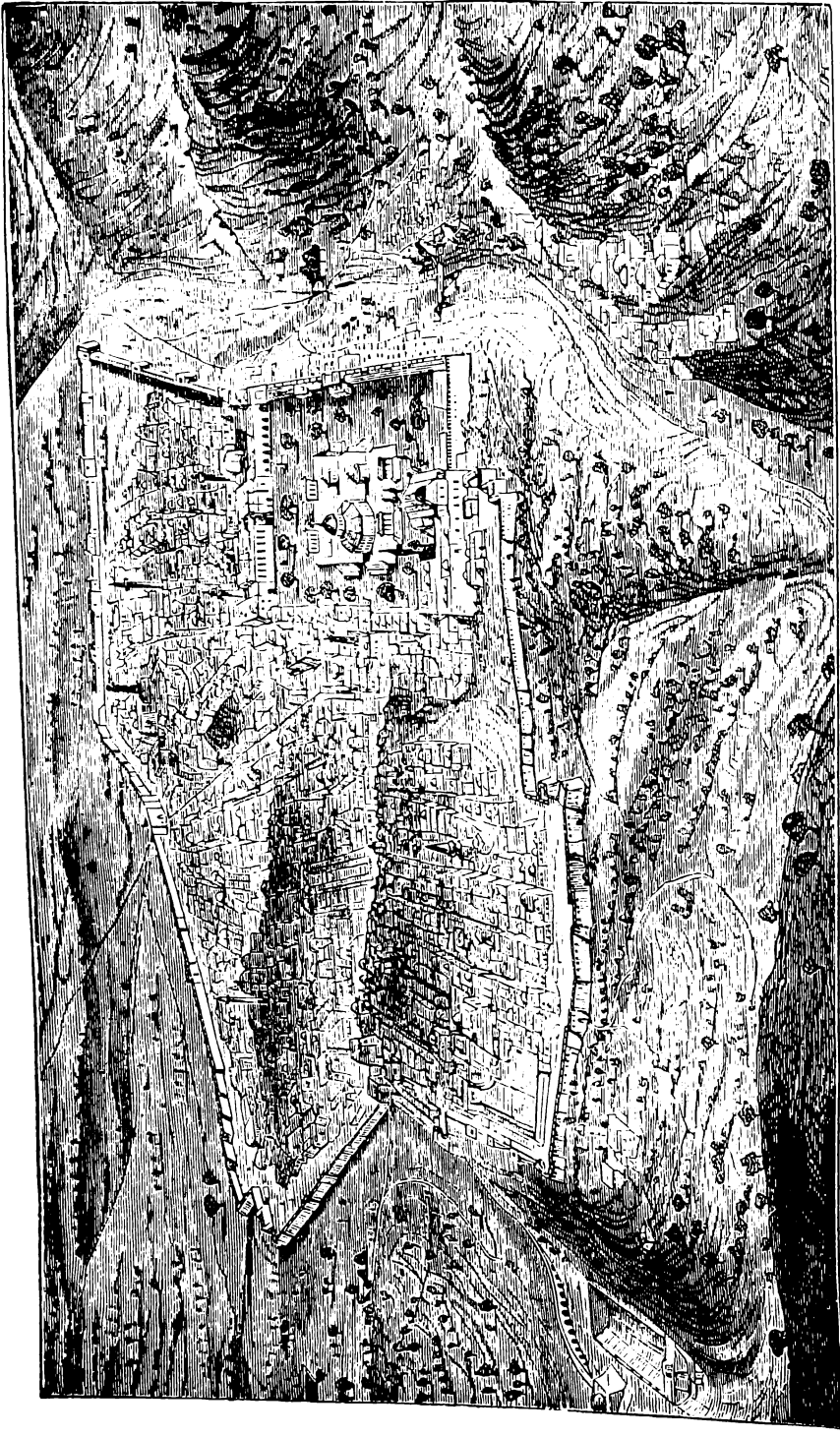
VIEW OF JERUSALEM FROM THE SOUTH.—Jerusalem covers four or five hill-summits. Within the city walls, on the south-east, is Mount Moriah the site of the temple, now covered by the Haram enclosure or square, within which is the hill Ophel, also without the wall. North of Mount Moriah is Bezetha, or the "new city," and west of Bezetha, in the north-west part of the city, is Akra. Still, however, regard Akra as the north-west part of Mount Zion.) East side of the city is the Kedron, or Valley of Jehoshaphat. South of Mount Zion is the Valley of Hinnom, which extends around on the east side of the city. The valleys of Hinnom and of Olivet unite south of the city. Beyond Olivet, and on the south the Hill of Evil Counsel, and Mount Zion is the Tyropseon Valley.—North of the city is Scopus, east of it the Mount of Olives, and on the south-east, is Mount Moriah.