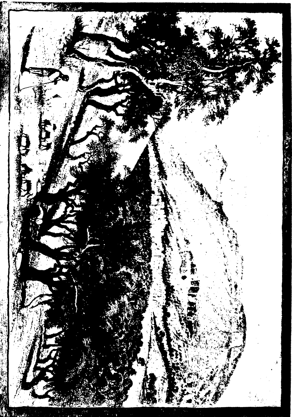
SCHIEHEM, BETWEEN MTS. EBAL AND GERIZIM. " A land of hills and valleys " (Deut. 11: 11).