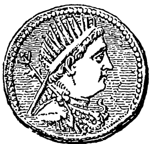
COIN OF PTOLEMY III.